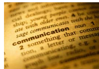
AIRUM conference is a one and half day event. Lunch is provided on both days.

AIRUM conference presentations soon available from the AIRUM home page.