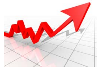
AIRUM finances strong—2008 conference fee of $150 same as last year.

11:30am to 1:30pm Lunch and Business Meeting