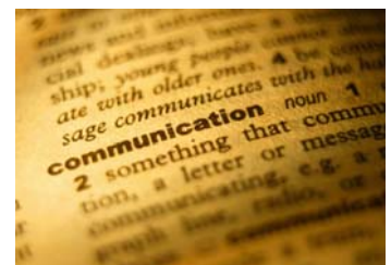
AIRUM conference is a one and half day event. Lunch is provided on both days.

AIRUM conference presentations soon available from the AIRUM home page.